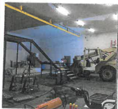
BUILDING STEPS FOR ENTERANCE INTO THE APARTMENT OF THE HANGAR!