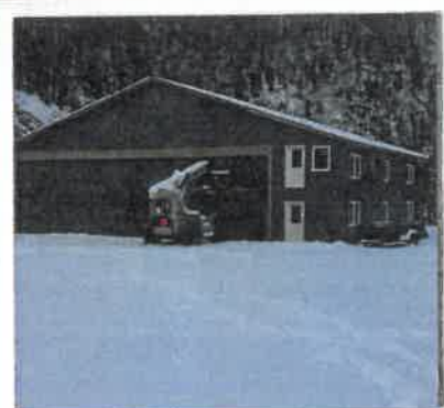
HANGAR DOOR COMPLETE, APARTMENT ON THE RIGHT