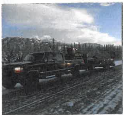
PICKING UP THE HANGAR DOOR FRAME IN WASHINGTON STATE IN NOVEMBER