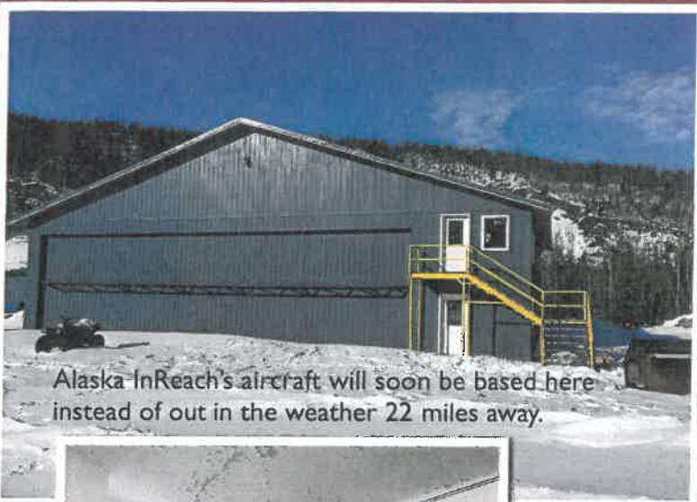
Alaska InReach's aircraft will soon be based here instead of out in the weather 22 miles away.